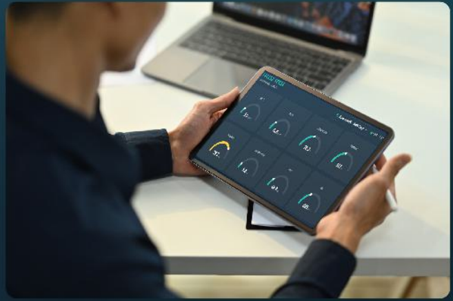
LIVE SENSOR DASHBOARD